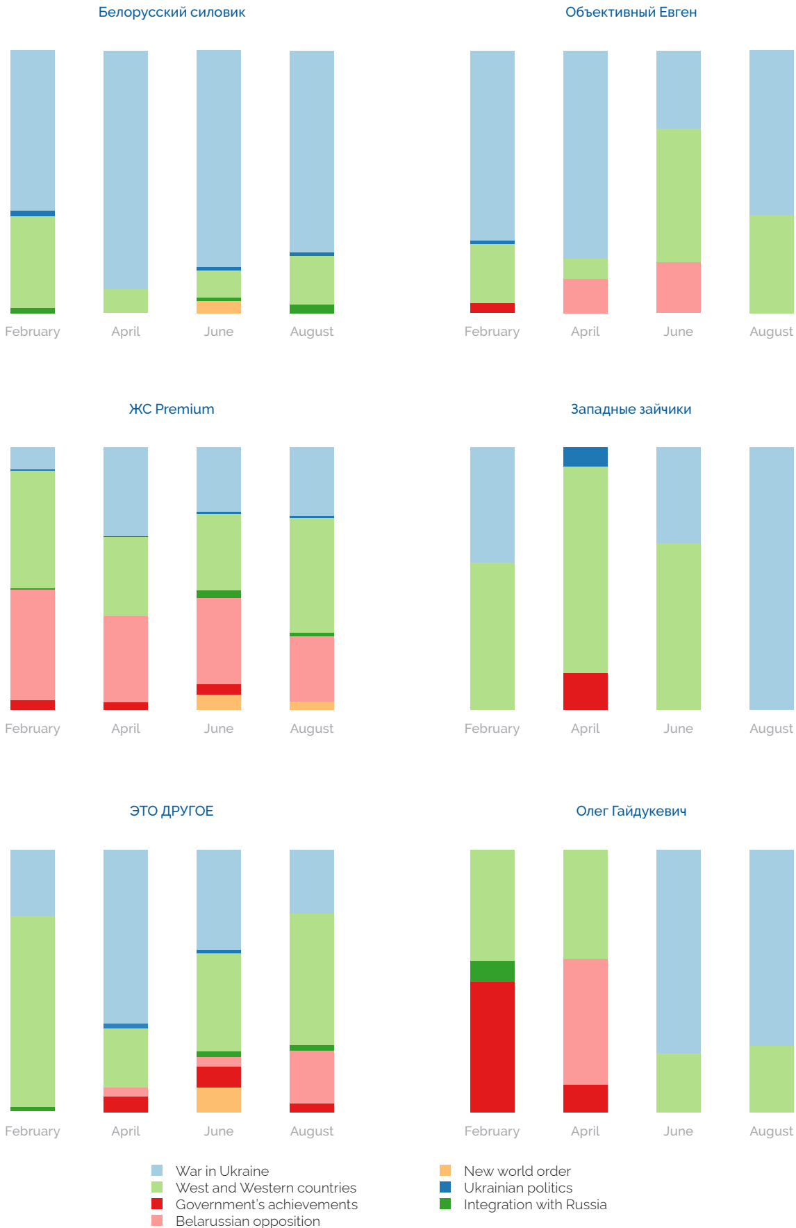
Figure 3. Key themes: distribution by main pro-government Telegram channels